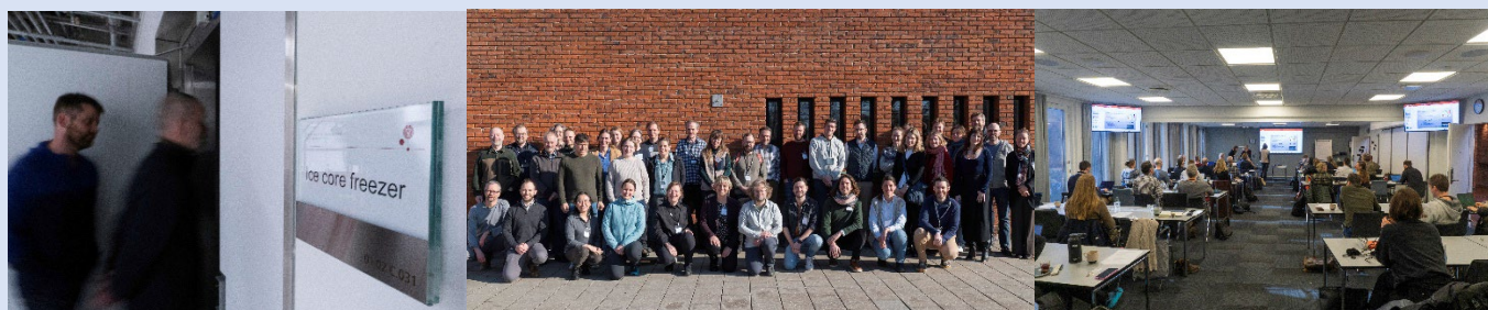
Photos from the Kick- off meeting